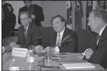
Ted and The Hon. Jim Flaherty, Minister of Finance meet with private sector economists